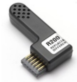
R200 - Replaceable Temperature/Humidity Sensor Angled Temperature/Humidity Replaceable Sensor