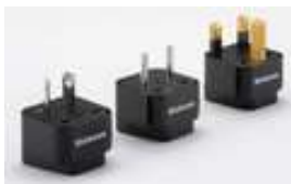
R066 - Universal Plug Kit for Data Loggers International Plug Kit for Data Loggers