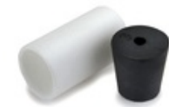
A868 - Sensor Dust Filter Sensor Dust Filter - prolong the life of your sensor.