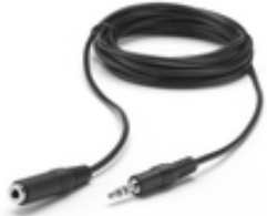
A062 - AC Adapter Extension Cable 10' Power Extension for R157 AC Adapter