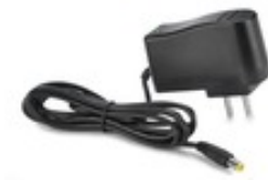
R180 - Replacement AC Adapter AC Adapter for TSB/TWE/TWP Loggers and the KT8/KT6 series.